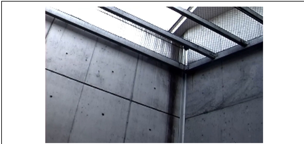
Figure 7 “Recreation Cage”