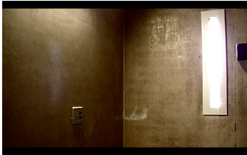
Figure 4 “Window” Slot