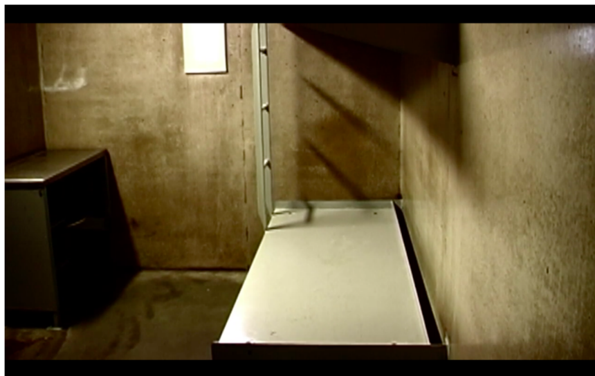
Figure 3 Bed and Desk