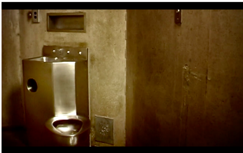
Figure 2 Sink and Toilet