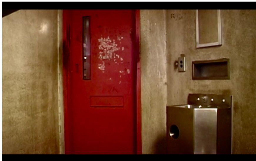
Figure 5 Sink and Door

36. A prisoner’s access to fresh air and direct sunlight comes from a trip to what is called the “recreation cage,” a space slightly larger than a cell, surrounded by approximately fourteen-foot concrete walls and topped by a steel cage. The only view is of the sky. Figures 6