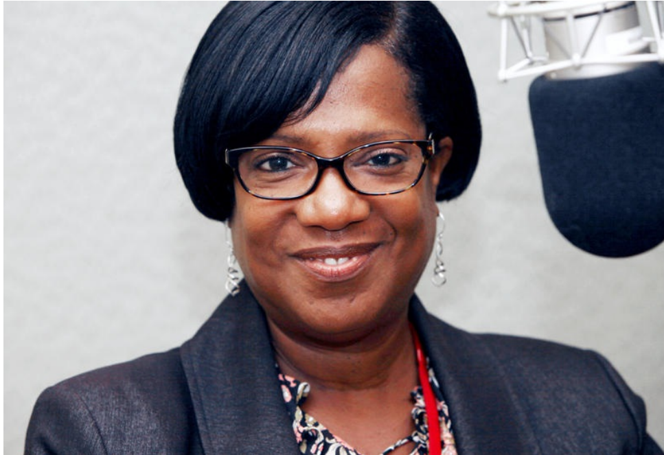
DMHAS Commissioner Miriam Delphin-Rittmon.