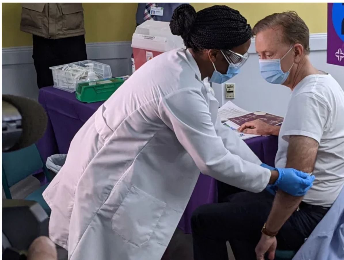
Gov. Ned Lamont gets his first COVID vaccine shot.

Disability Rights of Connecticut filed a complaint with the U.S. Office of Civil Rights Thursday challenging Gov. Ned Lamont's decision not to put people with underlying medical conditions first in line for the vaccine.