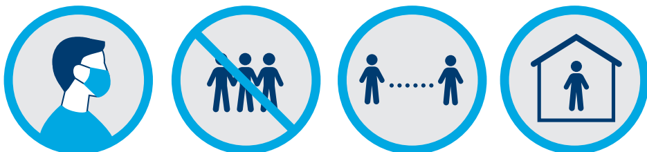
Wear A Mask