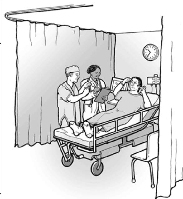
Image Caption: A doctor uses a sign language interpreter to communicate with a patient who is deaf.

Hospitals should have arrangements in place to ensure that qualified interpreters are readily available on a scheduled basis and on an unscheduled basis with minimal delay, including on-call arrangements for after-hours emergencies.