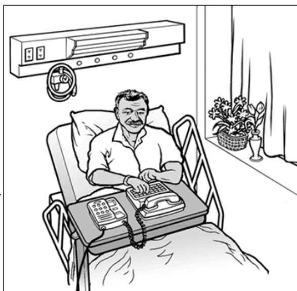
Image caption: A hospital patient uses a TTY in his hospital room.

If telephones and televisions are provided in patient rooms, the hospital must provide patients who are deaf or hard of hearing comparable accessible equipment