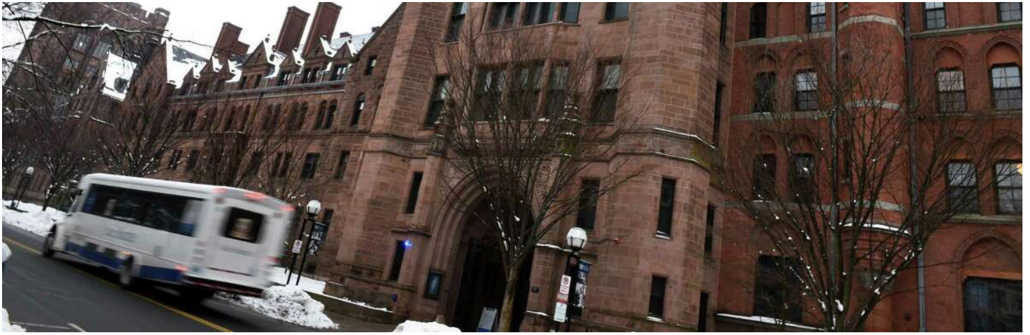
The entrance to Yale University's Old Campus across from the New Haven Green Feb. 9, 2021.

NEW HAVEN – Yale University has signaled a willingness to enter settlement discussions as it faces a pending lawsuit over its treatment of students with mental health disabilities .