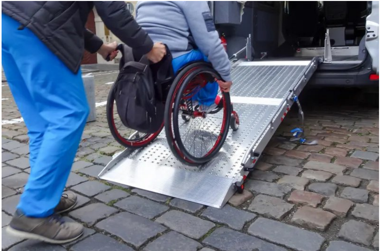
The Disabled face Challenges Voting in the Election

The Blind and Wheelchair Users Encounter issues with Absentee Ballots and Polling Places